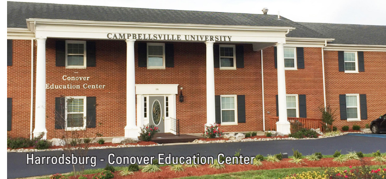
Harrodsburg - Conover Education Center