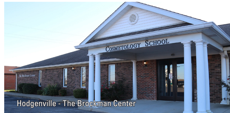
Hodgenville - The Brockman Center