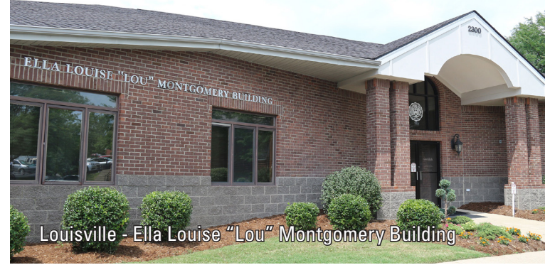
Louisville - Ella Louise "Lou" Montgomery Building