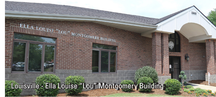
Louisville - Ella Louise "Lou" Montgomery Building