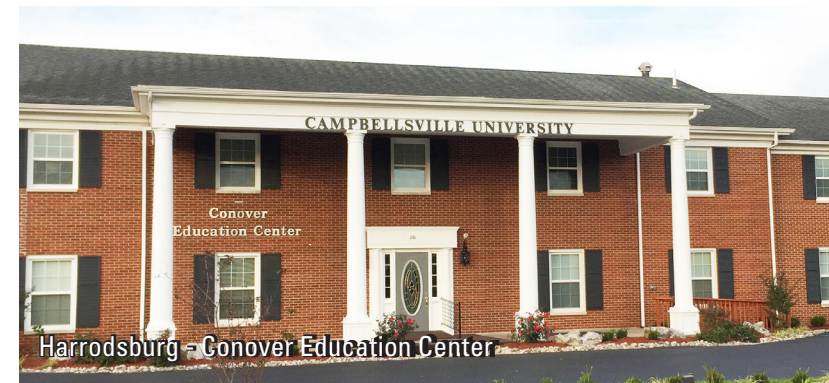
Harrodsburg - Conover Education Center