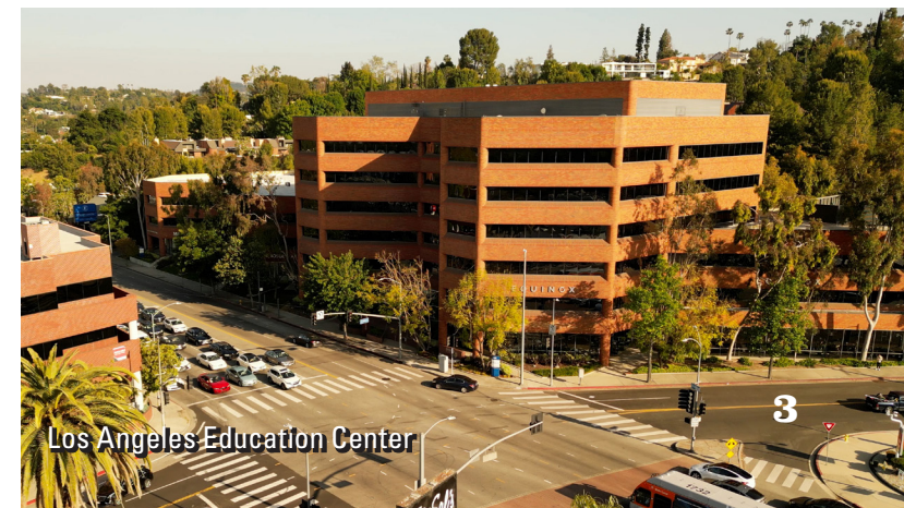
Los Angeles Education Center