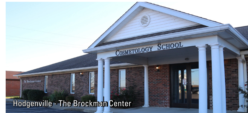
Hodgenville - The Brockman Center