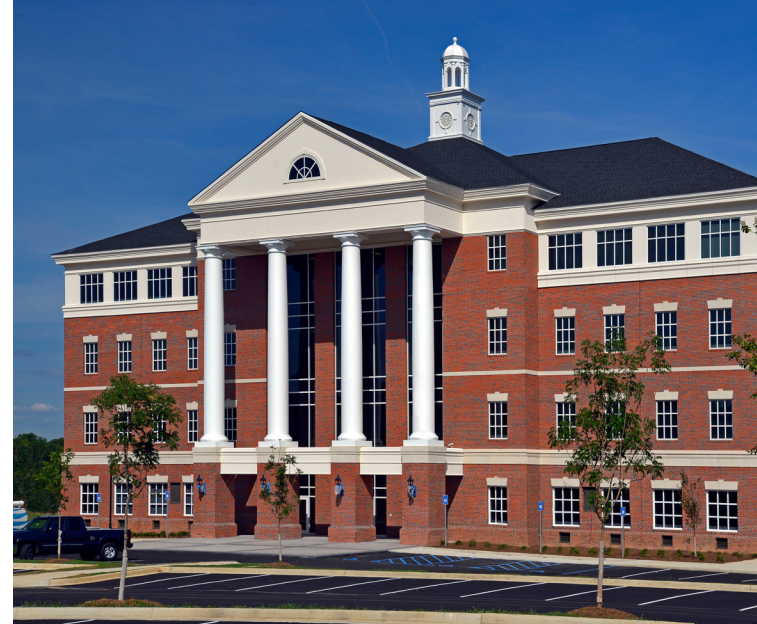
Phenix City Campus