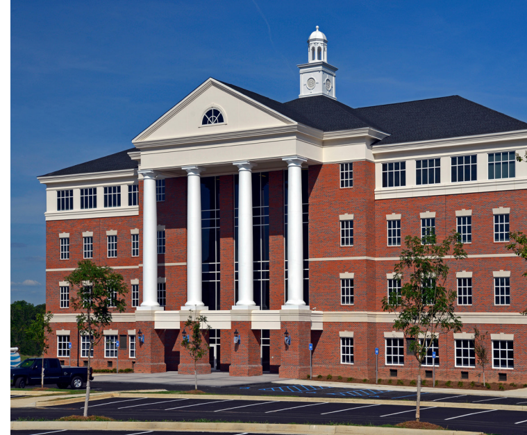
Phenix City Campus